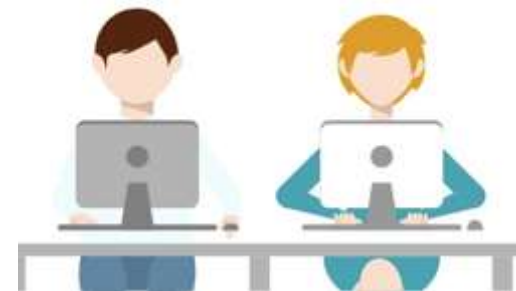
Shared Space Model